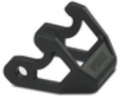
Replacement latch for HC-D7 housing

Housing brackets - HC-D07-SL-PLBK - 1424440